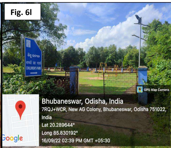
Fig. 6k- In-campus Open Gymnasium of RIE, Bhubaneswar; 6l - Children's Park of RIE campus