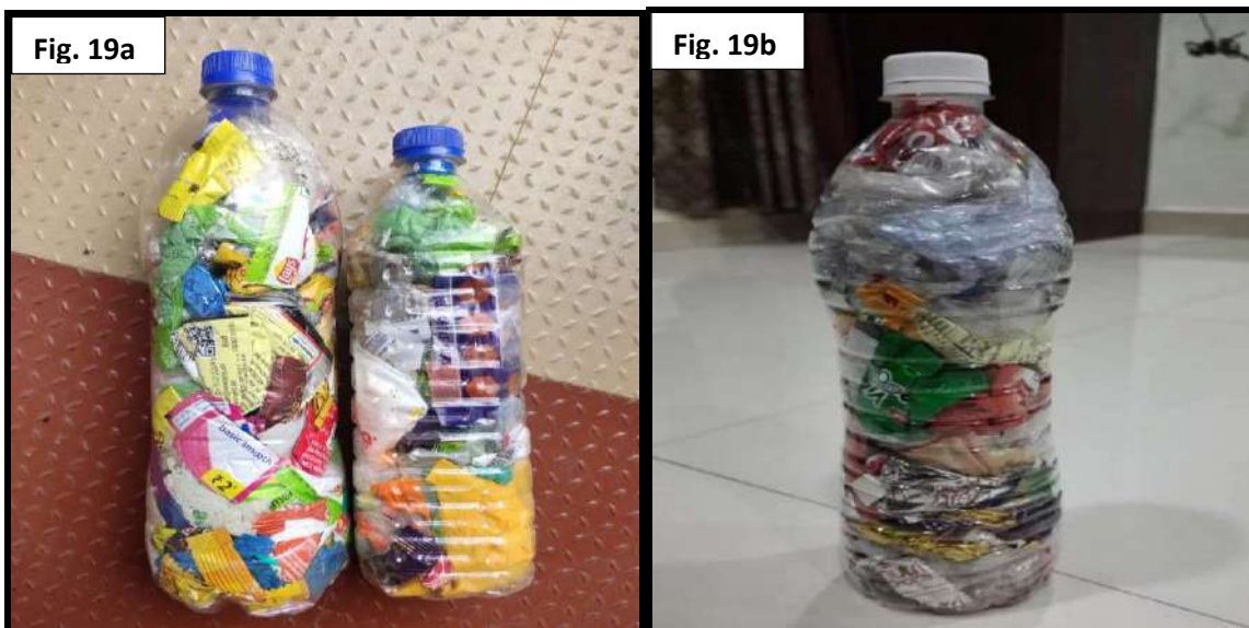
Fig. 19 (a –b) - The non-biodegradable plastics and single use plastics are carefully collected in bottles and are handed over to BMC.