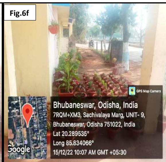
Fig. 6e & 6f– Hostel Gardens of Homibhabha hostel.