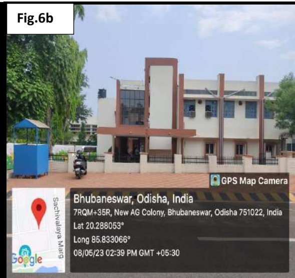
Fig. 6a Frontview of the Institution, 6b - Backview of the Institution