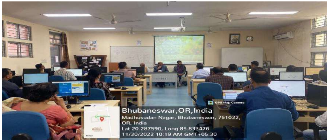
e-office training for faculty and staff