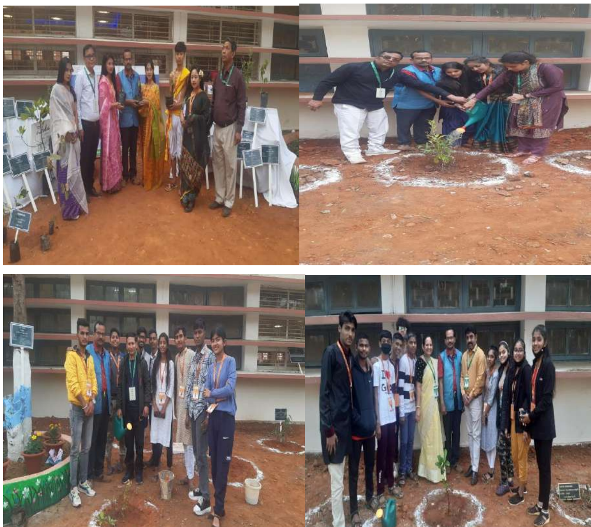
Fig. 32- Photographs of Plantation Drive Organized by the Institute on the Occasion of Kala Utsav 2023 Involving Participants from all 30 States.