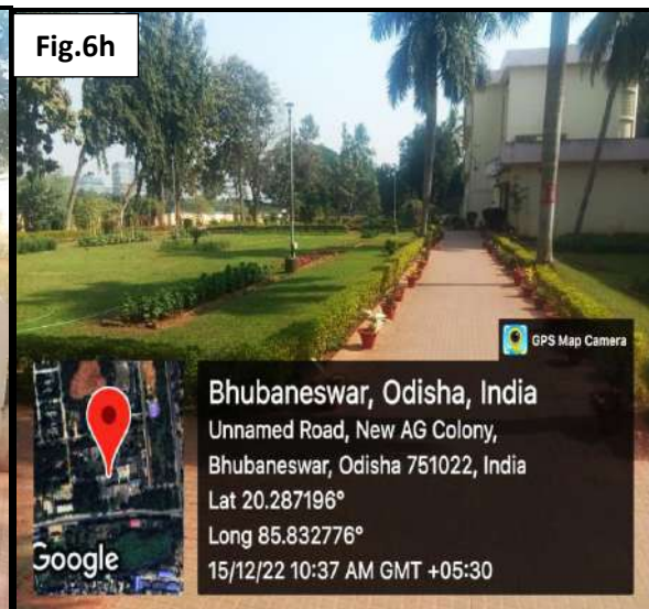
Fig. 6g & 6h– Hostel Gardens of Ramanujan and Gopabandhu Hostels.