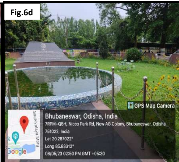
Fig. 6c & 6d – Garden Areas Inside the Main Building of RIE, Bhubaneswar