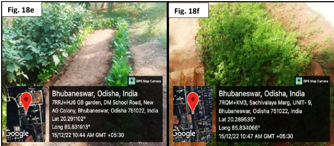
Fig. 18(a – f) -Kitchen Gardens from Kitchen Wastes Maintained by the Hostels in the Backyard and Frontyard of Different Hostels of RIE, Bhubaneswar.