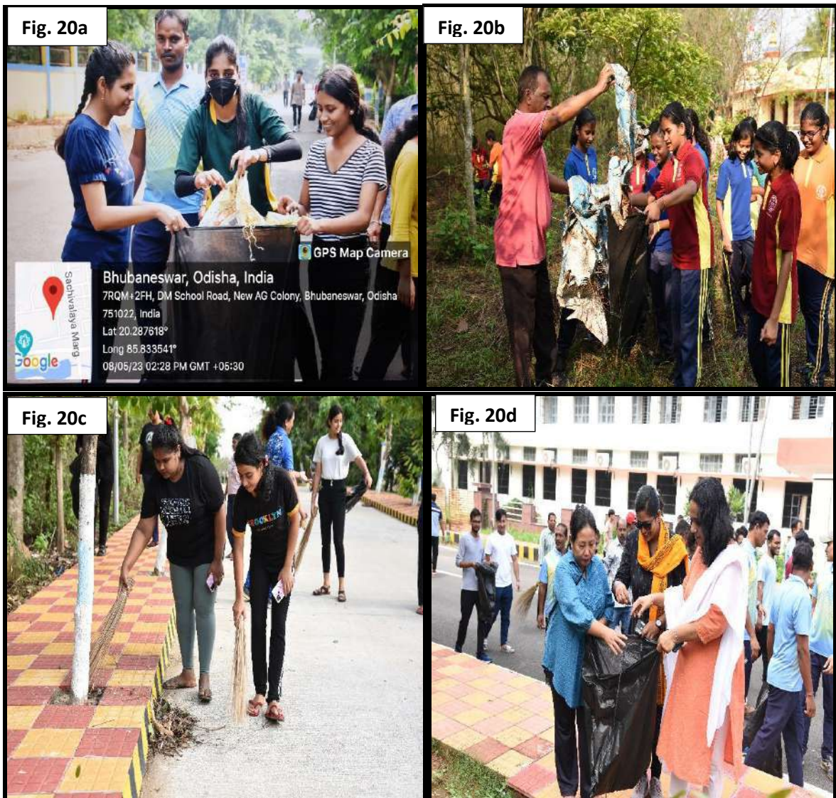
Fig. 20 (a – d) – Cleanliness Drives Organized in the Institute in Different Occasions Involving Faculty Members, Staff Members and Students.