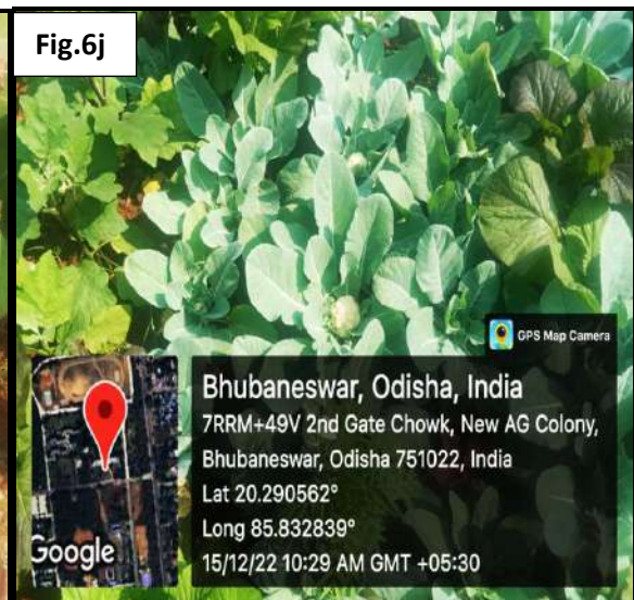
Fig. 6i & 6j – Kitchen Gardens maintained by the hostels.