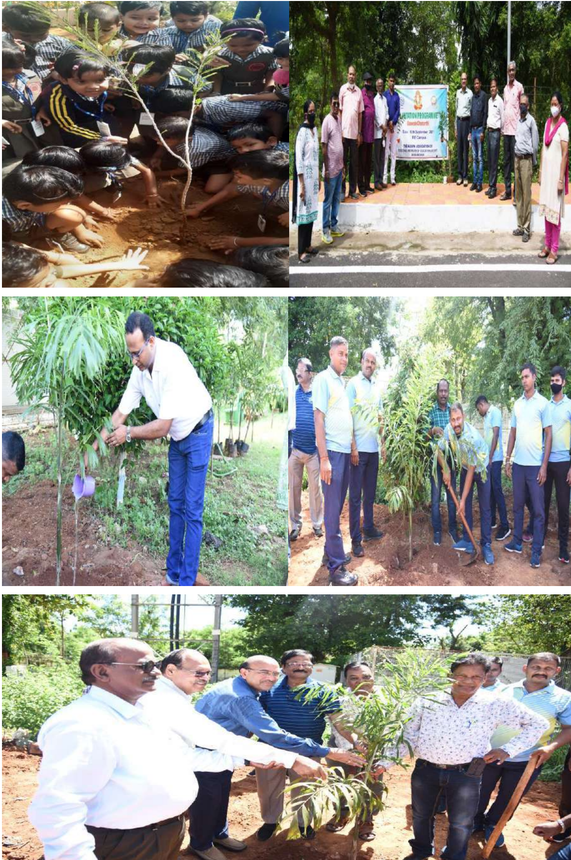
Fig. 31 – Photographs of Plantation Drives Organized in the Institute Involving Faculty Members, Staffs Members, Alumni and Students