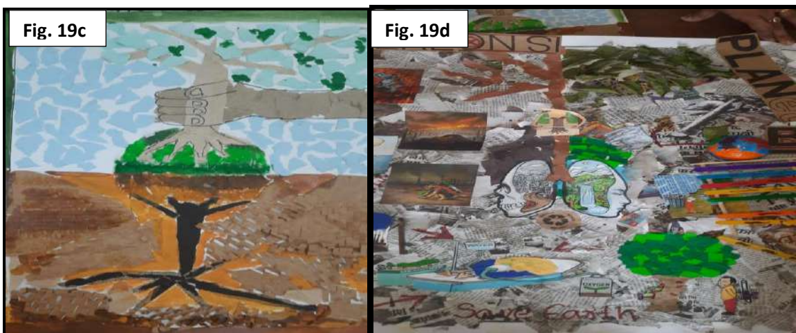
Fig. 19 (c – d) – Paintings Made out of Paper Wastes by the Students of the Institute to Spread Awareness Regarding Recycling of Paper Wastes